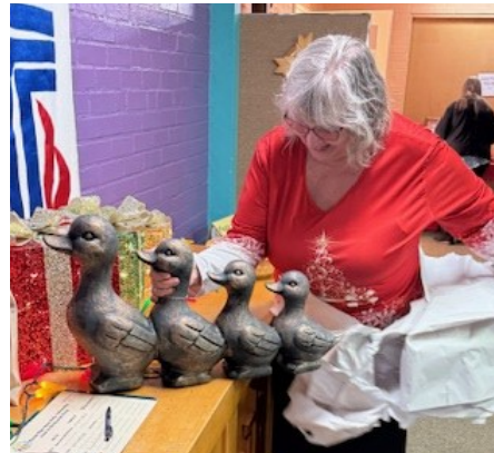
Dec. 21, 2025 She finally has all her ducks in a row!