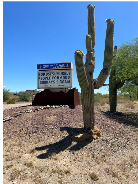
The Sermon Series on the sign outside