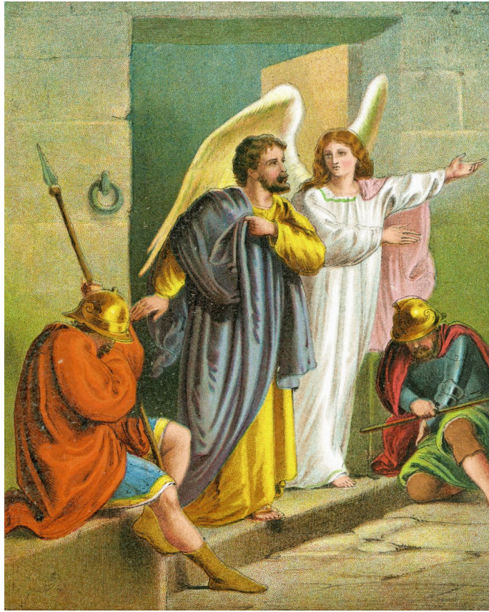
The Liberation of Saint Peter by an Angel, 1870 -English School