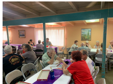
Game Night-Tuesday, June 6th