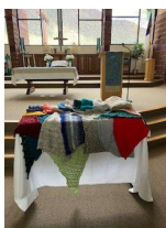
March 5th: Blessing of the Shawls