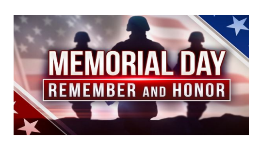
Monday May 29th