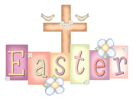
at The Holy Way..... April 9, 2023