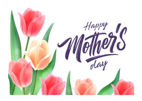
Sunday May 14th